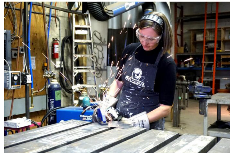
Portrait of the artist in her studio