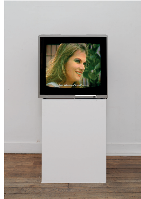
Body Double 31 , 2014 With Eva Svennung 4 minutes 31 secondes Color, sound after Basic Instinct (Paul Verhoeven)

Courtesy Brice Dellsperger and Galerie Air de Paris, ADAGP 2025. Photo: Aurelien Mole.