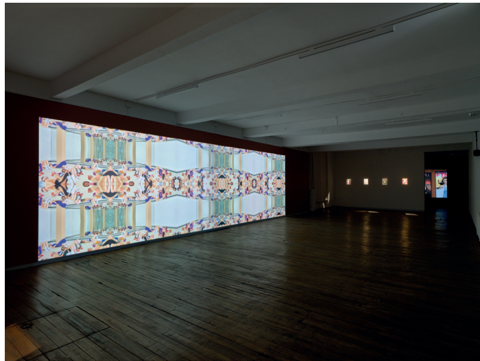
Body Double 36 , 2019 With Jean Biche 8 minutes 58 secondes Color, sound after Perfect (James Bridges)